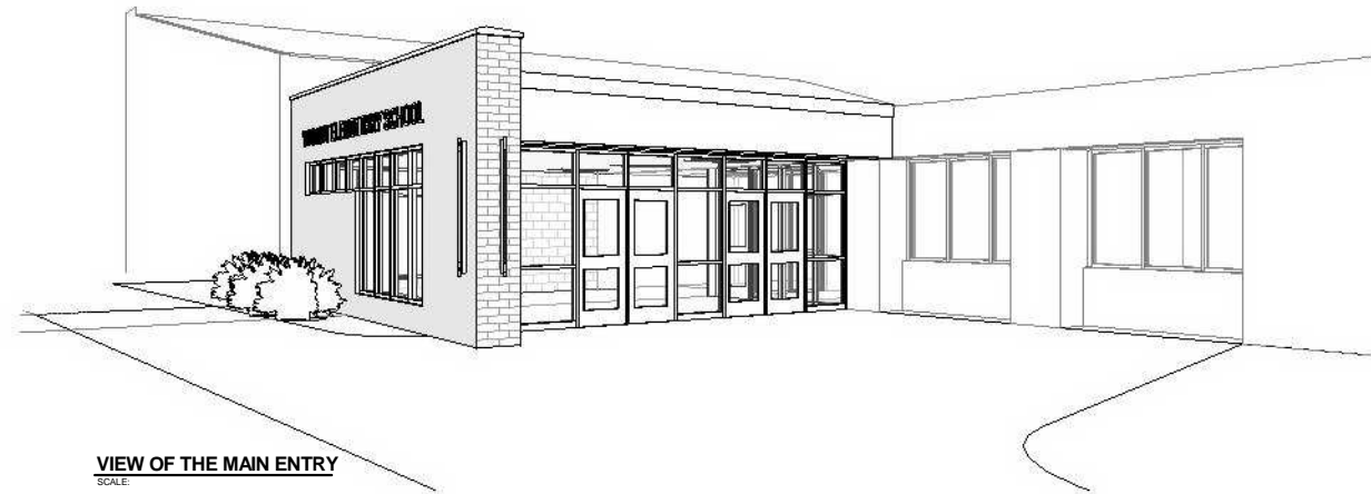
VIEW OF THE MAIN ENTRY SCALE: